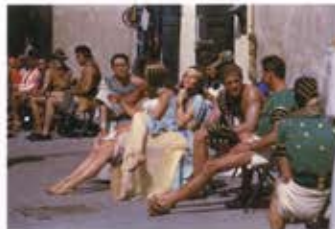
The Ten Commandments, Cast Members, 1956

Print: 16 x 20 in. Frame: 16 3/4 x 20 3/4 in. Medium: Archival Pigment Print Edition: 2 of 15