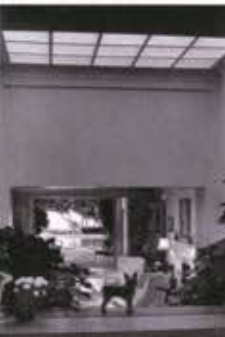
Pancho, Palm Beach, Florida, 1960

Print: 16 x 20 in. Frame: 16 3/4 x 20 3/4 in. Medium: Archival Pigment Print Edition: 2 of 15