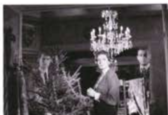
Anthony Perkins, Ingrid Bergman and Yves Montand, Goodbye Again, 1961

Print: 16 x 20 in. Frame: 16 3/4 x 20 3/4 in. Medium: Archival Pigment Print Edition: 2 of 15