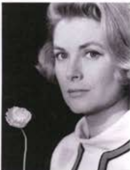
Grace Kelly, The Poppy Is Also A Flower, 1965 Print: 16 x 20 in. Frame: 16 3/4 x 20 3/4 in. Medium: Archival Pigment Print Edition: 2 of 15