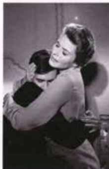
Ingrid Bergman and Anthony Perkins, Goodbye Again, 1961 Print: 16 x 20 in. Frame: 16 3/4 x 20 3/4 in. Medium: Archival Pigment Print Edition: 2 of 15