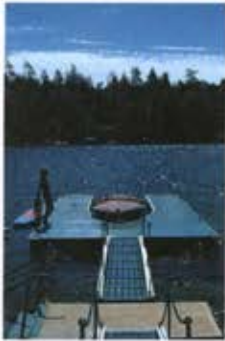
Lake Arrowhead, boat, California, 1956 Print: 30 x 40 Framed: 31 x 41 Medium: Archival Pigment Print Edition: 1 of 8