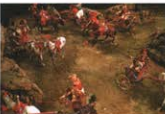
The set of The Ten Commandments, horses, 1956

Print: 16 x 20 in. Frame: 16 3/4 x 20 3/4 in. Medium: Archival Pigment Print Edition: 2 of 15