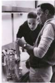
Doris and Frank Sinatra, Palm Springs, 1963 Print: 16 x 20 in. Frame: 16 3/4 x 20 3/4 in. Medium: Archival Pigment Print Edition: 2 of 15