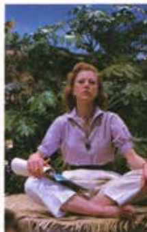
The Ten Commandments, Script Girl, 1956

Print: 16 x 20 in. Frame: 16 3/4 x 20 3/4 in. Medium: Archival Pigment Print Edition: 2 of 15