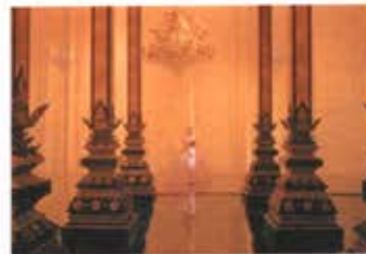
Deborah Kerr on the set of The King and I, 1956

Print: 16 x 20 in. Frame: 16 3/4 x 20 3/4 in. Medium: Archival Pigment Print Edition: 2 of 15