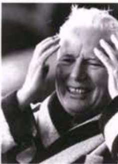
Charlie Chaplin, La Reine Jeanne, France, 1960 Print: 16 x 20 in. Frame: 16 3/4 x 20 3/4 in. Medium: Archival Pigment Print Edition: 2 of 15