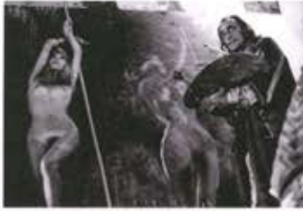
Salvador Dali painting Amanda Lear, Spain, 1971 Print: 16 x 20 in. Frame: 16 ¾ x 20 ¾ in. Medium: Archival Pigment Print Edition: 5 of 15

LIFE STYLE (volume 1) LIFE ON SET (volume 2)