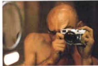
The King and I, Self Portrait, 1956

Print: 16 x 20 in. Frame: 16 3/4 x 20 3/4 in. Medium: Archival Pigment Print Edition: 2 of 15