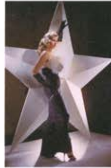
Anita Ekberg with star, Hollywood, 1956 Print: 16 x 20 in. Frame: 16 ¾ x 20 ¾ in. Medium: Archival Pigment Print Edition: 2 of 15