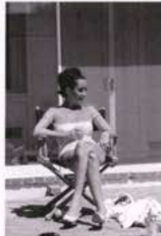
Elizabeth Taylor at home, Hollywood, 1959

Print: 30 x 40 Framed: 31 x 41 Medium: Archival Pigment Print Edition: 1 of 8