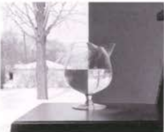
Glass Study, La Reine Jeanne, France, 1956

Print: 30 x 40 Framed: 31 x 41 Medium: Archival Pigment Print Edition: 1 of 8