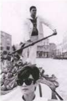
Audrey Hepburn, Venice, 1965 Print: 30 x 40 Framed: 31 x 41 Medium: Archival Pigment Print Edition: 3 of 8