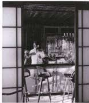
Dean Martin at Frank Sinatra's home, Los Angeles, 1963

Print: 16 x 20 in. Frame: 16 3/4 x 20 3/4 in. Medium: Archival Pigment Print Edition: 2 of 15