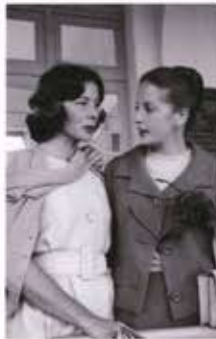
Bettina Graziani and Doris, Deauville, France, 1961 Print: 16 x 20 in. Frame: 16 3/4 x 20 3/4 in. Medium: Archival Pigment Print Edition: 2 of 15