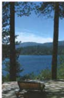
Lake Arrowhead, California, 1956

Print: 16 x 20 in. Frame: 16 3/4 x 20 3/4 in. Medium: Archival Pigment Print Edition: 2 of 15