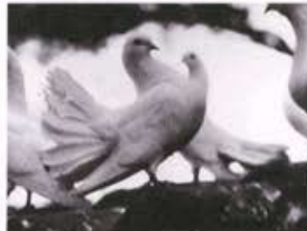
Doves, La Reine Jeanne, France, 1956

Print: 16 x 20 in. Frame: 16 3/4 x 20 3/4 in. Medium: Archival Pigment Print Edition: 2 of 15