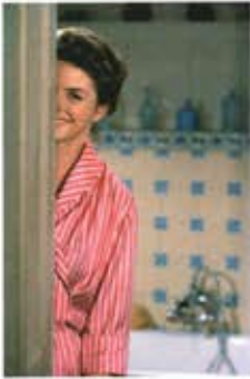
Ingrid Bergman on set of Goodbye Again, 1961

Print: 16 x 20 in. Frame: 16 3/4 x 20 3/4 in. Medium: Archival Pigment Print Edition: 2 of 15