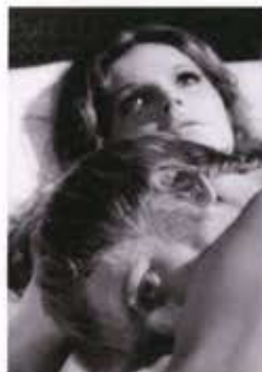
Samantha Eggar and John McEnery, The Lady in the Car with Glasses and a Gun, 1970 Print: 16 x 20 in. Frame: 16 3/4 x 20 3/4 in. Medium: Archival Pigment Print Edition: 3 of 15