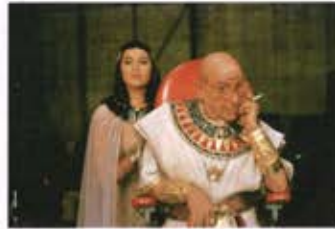
Sir Cedric Hardwicke smoking, The Ten Commandments, 1956

Print: 16 x 20 in. Frame: 16 3/4 x 20 3/4 in. Medium: Archival Pigment Print Edition: 2 of 15