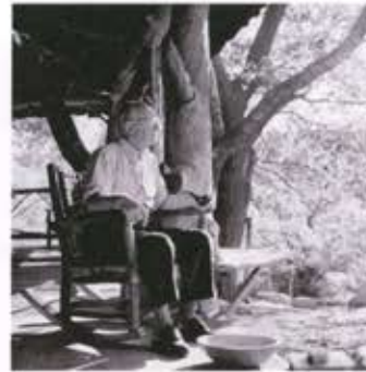
Cecil B. DeMille, Paradise Ranch, California, 1955

Print: 16 x 20 in. Frame: 16 3/4 x 20 3/4 in. Medium: Archival Pigment Print Edition: 2 of 15