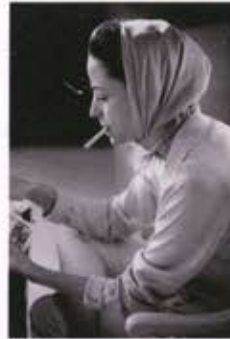
Gloria Guinness, Palm Beach, 1960

Print: 16 x 20 in. Frame: 16 3/4 x 20 3/4 in. Medium: Archival Pigment Print Edition: 2 of 15