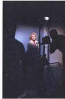
Ingrid Bergman, Studio Shoot for Anastasia Print: 16 x 20 in. Frame: 16 ¾ x 20 ¾ in. Medium: Archival Pigment Print Edition: 2 of 15