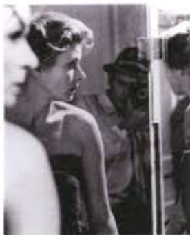
Self-portrait with Ingrid Bergman, Goodbye Again, 1961

Print: 16 x 20 in. Frame: 16 3/4 x 20 3/4 in. Medium: Archival Pigment Print Edition: 5 of 15