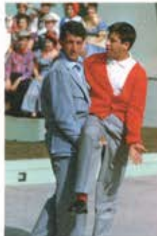
Dean Martin and Jerry Lewis, The Colgate Comedy Hour, 1955 Print: 16 x 20 in. Frame: 16 ¾ x 20 ¾ in. Medium: Archival Pigment Print Edition: 2 of 15