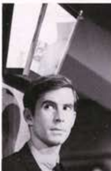
Anthony Perkins on set of Goodbye Again, 1961 Print: 16 x 20 in. Frame: 16 3/4 x 20 3/4 in. Medium: Archival Pigment Print Edition: 2 of 15