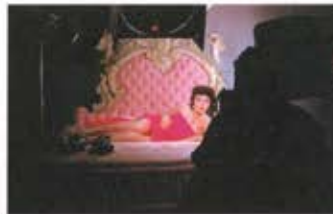
Joan Collins, Hollywood, 1956 Print: 16 x 20 in. Frame: 16 ¾ x 20 ¾ in. Medium: Archival Pigment Print Edition: 2 of 15