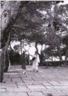
Charlie and Oona Chaplin, La Reine Jeanne, August, 1960 Print: 16 x 20 in. Frame: 16 3/4 x 20 3/4 in. Medium: Archival Pigment Print Edition: 2 of 15