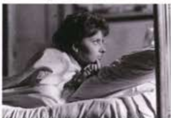
Sophia Loren, Houseboat, 1957 Print: 16 x 20 in. Frame: 16 3/4 x 20 3/4 in. Medium: Archival Pigment Print Edition: 2 of 15