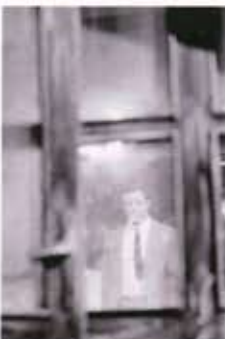
Marcello Mastroianni on set of The Poppy Is Also A Flower, 1965 Print: 16 x 20 in. Frame: 16 3/4 x 20 3/4 in. Medium: Archival Pigment Print Edition: 2 of 15