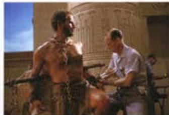
Charlton Heston on the set of The Ten Commandments, 1956

Print: 16 x 20 in. Frame: 16 3/4 x 20 3/4 in. Medium: Archival Pigment Print Edition: 2 of 15