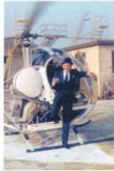
Frank Sinatra, Hollywood, 1964 Print: 16 x 20 in. Frame: 16 3/4 x 20 3/4 in. Medium: Archival Pigment Print Edition: 2 of 15