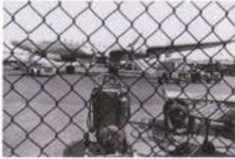
Idlewild Airport, New York, 1952

Print: 16 x 20 in. Frame: 16 3/4 x 20 3/4 in. Medium: Archival Pigment Print Edition: 2 of 15