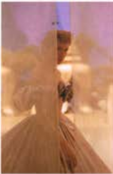
Deborah Kerr, Shall We Dance?, The King and I, 1956

Print: 16 x 20 in. Frame: 16 3/4 x 20 3/4 in. Medium: Archival Pigment Print Edition: 2 of 15