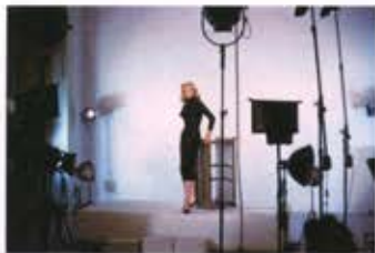
Anita Ekberg, Hollywood, 1956 Print: 16 x 20 in. Frame: 16 3/4 x 20 3/4 in. Medium: Archival Pigment Print Edition: 2 of 15