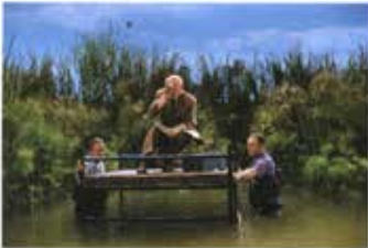
Cecil B. DeMille on the set of The Ten Commandments, 1956

Print: 16 x 20 in. Frame: 16 3/4 x 20 3/4 in. Medium: Archival Pigment Print Edition: 2 of 15