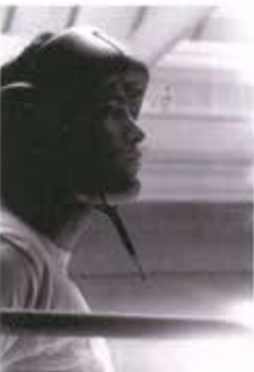
Bobo Olson, Harlem, 1954

Print: 16 x 20 in. Frame: 16 3/4 x 20 3/4 in. Medium: Archival Pigment Print Edition: 2 of 15