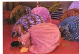
The King and I, Bowing, 1956

Print: 16 x 20 in. Frame: 16 3/4 x 20 3/4 in. Medium: Archival Pigment Print Edition: 2 of 15