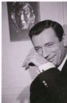
Yves Montand on set of Goodbye Again, 1961 Print: 16 x 20 in. Frame: 16 3/4 x 20 3/4 in. Medium: Archival Pigment Print Edition: 2 of 15