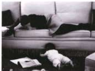
Doris with her daughter Victoria, Switzerland, 1963

Print: 16 x 20 in. Frame: 16 3/4 x 20 3/4 in. Medium: Archival Pigment Print Edition: 2 of 15