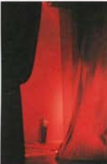
The King and I, 20th Century Fox Studios, Los Angeles, 1956

Print: 16 x 20 in. Frame: 16 3/4 x 20 3/4 in. Medium: Archival Pigment Print Edition: 2 of 15