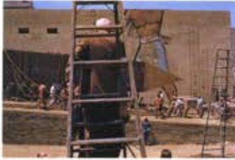
Cecil B. DeMille on a ladder, The Ten Commandments, 1956

Print: 16 x 20 in. Frame: 16 3/4 x 20 3/4 in. Medium: Archival Pigment Print Edition: 2 of 15