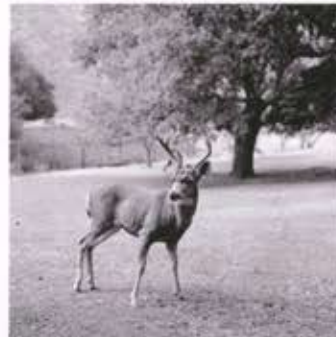
Paradise Ranch, California, 1955

Print: 16 x 20 in. Frame: 16 3/4 x 20 3/4 in. Medium: Archival Pigment Print Edition: 2 of 15