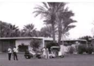
Frank Sinatra golfing with friends, Palm Springs, 1960 Print: 16 x 20 in. Frame: 16 3/4 x 20 3/4 in. Medium: Archival Pigment Print Edition: 2 of 15