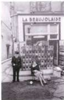
Ingrid Bergman and a cast member, Goodbye Again, 1961

Print: 16 x 20 in. Frame: 16 3/4 x 20 3/4 in. Medium: Archival Pigment Print Edition: 2 of 15